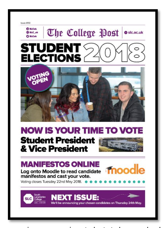
Above: Poster campaign encouraging students to become leaders